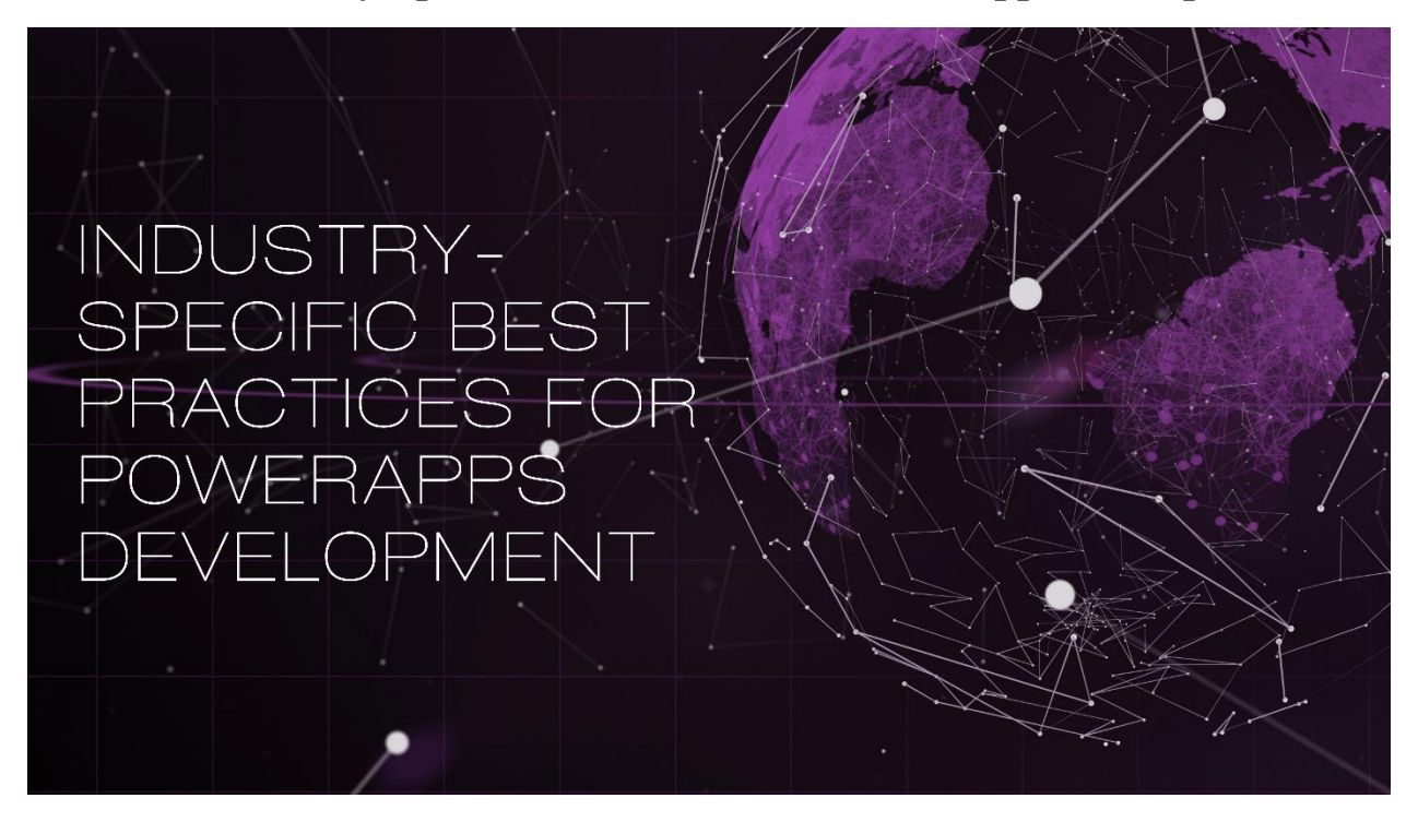
Title: Industry-Specific Best Practices for PowerApps Development